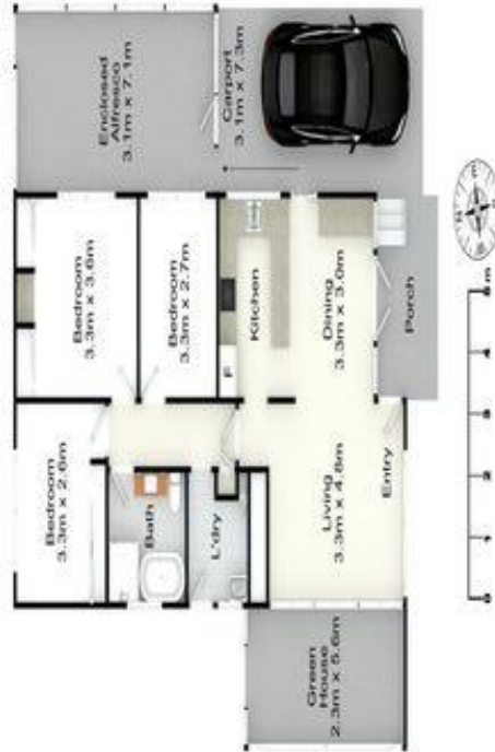
35 Greta St, Telarah

All information contained herein is gathered from sources we deem reliable. However, we cannot guarantee its accuracy and act as a messenger only in passing on the details. You should rely on their own inquiries and the contract for sale. The floor plans are artist's impressions only. The site plan is not to scale.